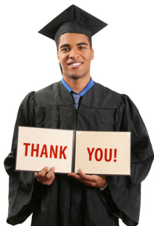
Private School Affordability

With these added scholarships, Chart 1 also shows how the number of affordable private schools increases by simply raising the tuition range to $5,000. The pool of affordable private schools grows by 10 percentage points to 74.1 percent. Under this budget scenario, a voucher family would have to come up with $166 per month per child, or $332 per month for two children in the family – still around the cost of a car payment.